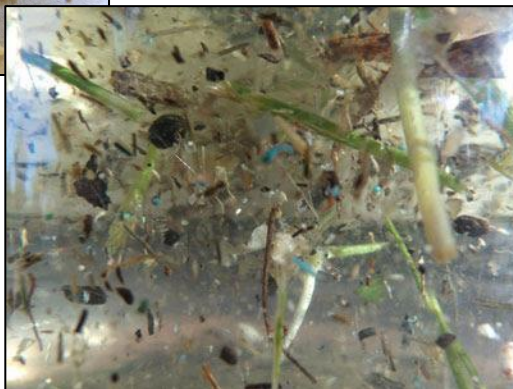
Right: Water sample from Back River September 2015.