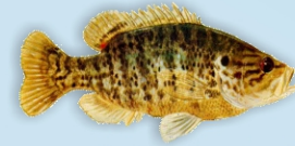
warmouth ( Lepomis gulosus )