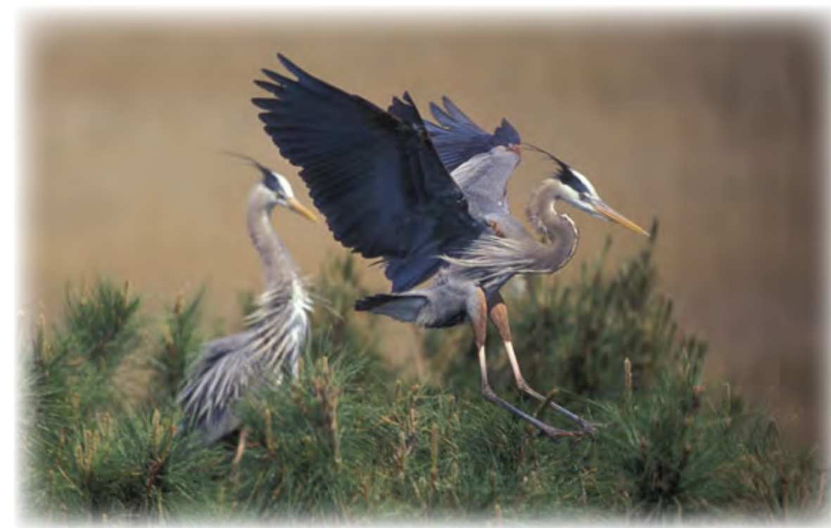
Great Blue Heron ( Ardea herodias )

For the first 7 miles, agricultural fields, woods and regenerating clear cuts dominate the landscape. In summer, look for songbirds, such as Blue Grosbeak, Summer Tanager and Red-headed Woodpecker, in shrubby harvested areas with standing dead trees. Once the Loblolly Pine forest becomes the primary habitat, Pine Warbler and Brown-headed Nuthatch are common. The latter is most often heard giving its rubber-ducky squeaky call from the edge of the forest as it opens into marsh. From here until you reach Elliott, the road shoulder in many areas is wet and soft, so be careful to pull off only in gravel parking areas.