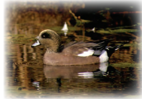
American Wigeon ( Anas americana )

Sometimes called "the Everglades of Maryland," the wet, grass-like meadows known as salt marshes cover much of the southern extent of the County. Marshes are home to yet another suite of birds, many of which tend to hide in the grasses and are more likely heard than seen. Some are more active at dawn and dusk or at night rather than during the day. Breeding birds include, Black Duck, Northern Harrier, four rail species, Marsh Wren and Seaside Sparrow. Egrets and herons are seen spearing fishes along waterways. Most common during migration, shorebirds are found feeding among muddy openings within the marshes. These marshes are one of the best places in the State to find wintering Northern Harrier, Rough-legged Hawk and in late afternoon, Short-eared Owl.