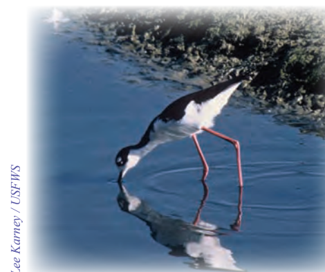
Black-necked Stilt ( Himantopus mexicanus )

As the tree line along the right disappears, look for the Bald Eagle's large stick nest, which frequently has adults or dark-plumaged young nearby. Look for waterfowl on the left at Savanna Lake. The pond on the right with scattered mud clumps and muddy edges is the best location for Common Moorhen and may also contain waterfowl, Black-necked Stilt and other shorebirds. Past the lake there is a primitive boat launch on the right. This launch provides entry to one of Fishing Bay's water trails for an extraordinary view of birds from canoe or kayak.