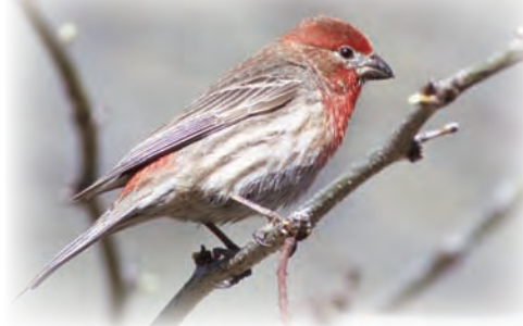
House Finch ( Carpodacus mexicanus )

Road you will come to a stop sign. Turn right onto Hoopers Island Road (Route 335) through Golden Hill. Scan for raptors, herons and other marshbirds in this area. As the southbound route winds through pine woodlands, listen for the telltale rubber-ducky squeak of Brown-headed Nuthatch.