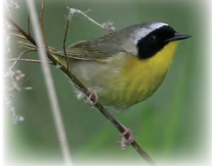
Common Yellowthroat ( Geothlypis trichas )

From Cambridge (Route 50 east), turn onto Route 16 west. Continue on this road until you reach the town of Church Creek. The park and ride lot at the corner of Route 16 and Route 335 is a good stopping point and may offer some viewing opportunities.