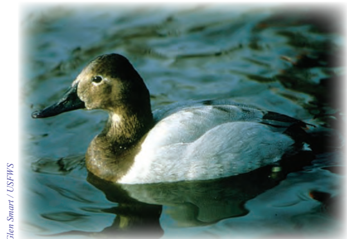
Canvasback Hen ( Aythya valisineria )

Turn right at the stop sign onto Drawbridge Road, continuing for two miles to the Chicamacomico River. The habitats presented here are very similar to those of the Transquaking River. The marshes extend along the route as it turns to the right. After passing Henry's Crossroads Road (where you can join the Elliott Island Trail), continue for 6.5 miles to reach the marshes at Bestpitch. This is another excellent location for viewing Short-eared Owl in winter and Northern Harrier and Bald Eagle year-round. Shorebirds frequent the mudflats south of the road and secretive, but vocal, marshbirds occur throughout. Cross the old wooden bridge and continue on Bestpitch Ferry Road for 4 miles to Greenbriar Road at Bucktown. From here you can turn left and join the Blackwater Refuge Route or follow Bucktown Road for 7 miles to rejoin Route 50, where a left turn on Route 50 East will take you back to Cambridge.