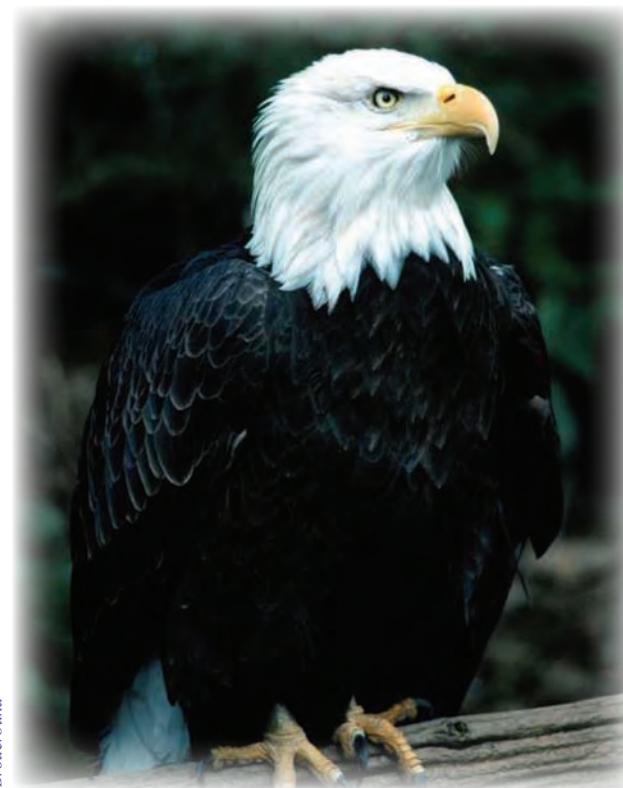
Bald Eagle ( Haliaeetus leucocephalus )

FIELDS - Depending on the time of year, agricultural fields provide habitat for many different birds. During the winter, geese and swans feed on leftover corn. During spring and fall migration, flocks of shorebirds, such as plovers and