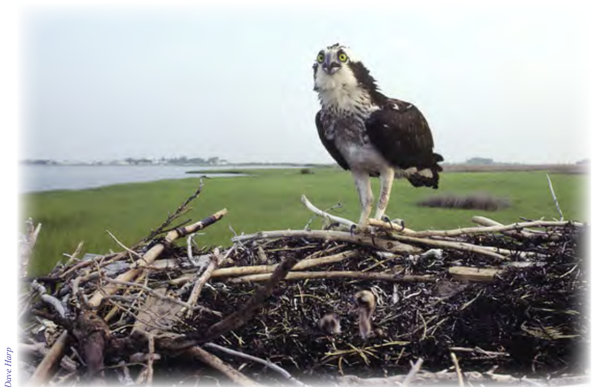
Osprey ( Pandion haliaetus )

As the tree line along the right disappears, look for the Bald Eagle's large stick nest, which frequently has adults or dark-plumaged young nearby. Look for waterfowl on the left at Savanna Lake. The pond on the right with scattered mud clumps and muddy edges is the best location for Common Moorhen and may also contain waterfowl, Black-necked Stilt and other shorebirds. Past the lake there is a primitive boat launch on the right. This launch provides entry to one of Fishing Bay's water trails for an extraordinary view of birds from canoe or kayak.