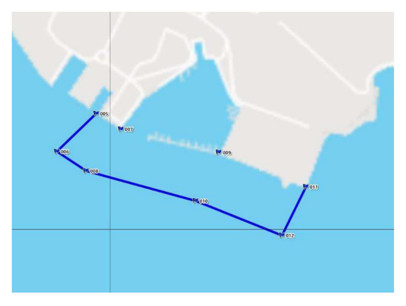
*Area enclosed by the dark-blue line on map (above) is the approximate requested area.