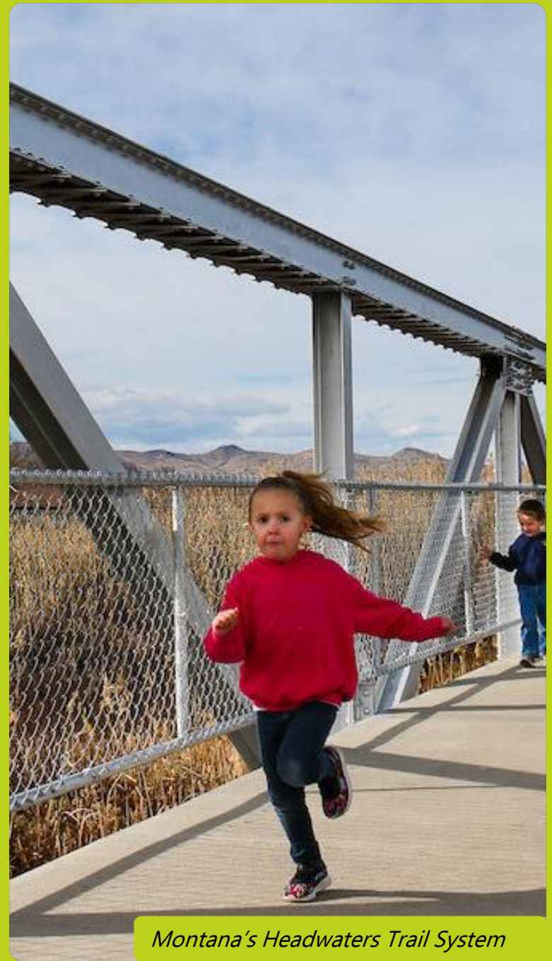
Montana's Headwaters Trail System