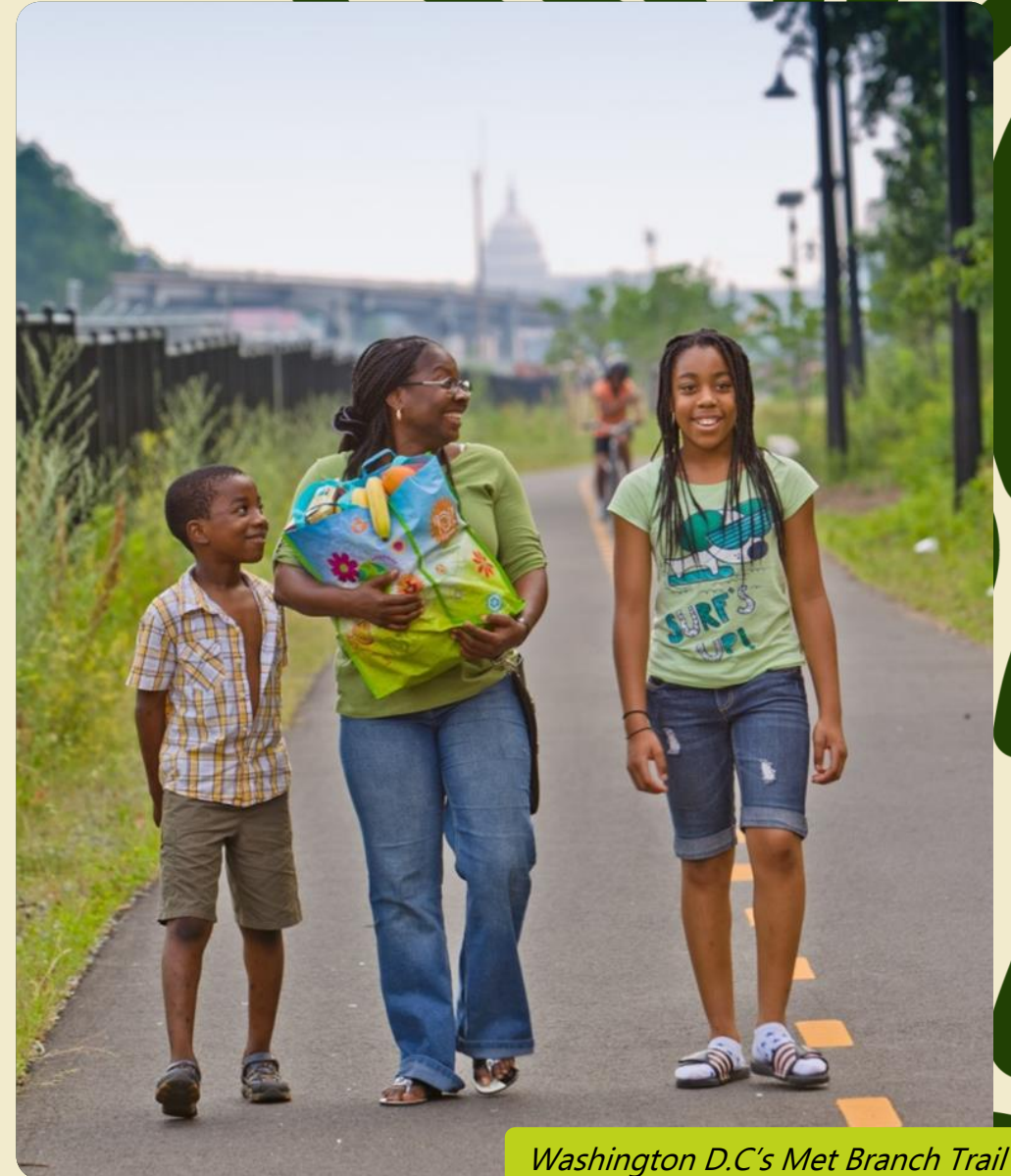
Washington D.C's Met Branch Trail