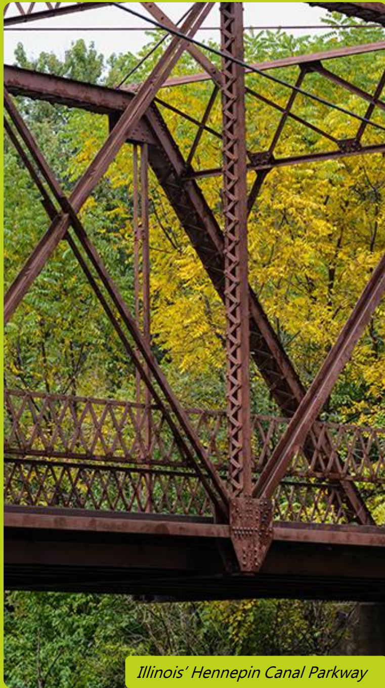
Illinois' Hennepin Canal Parkway