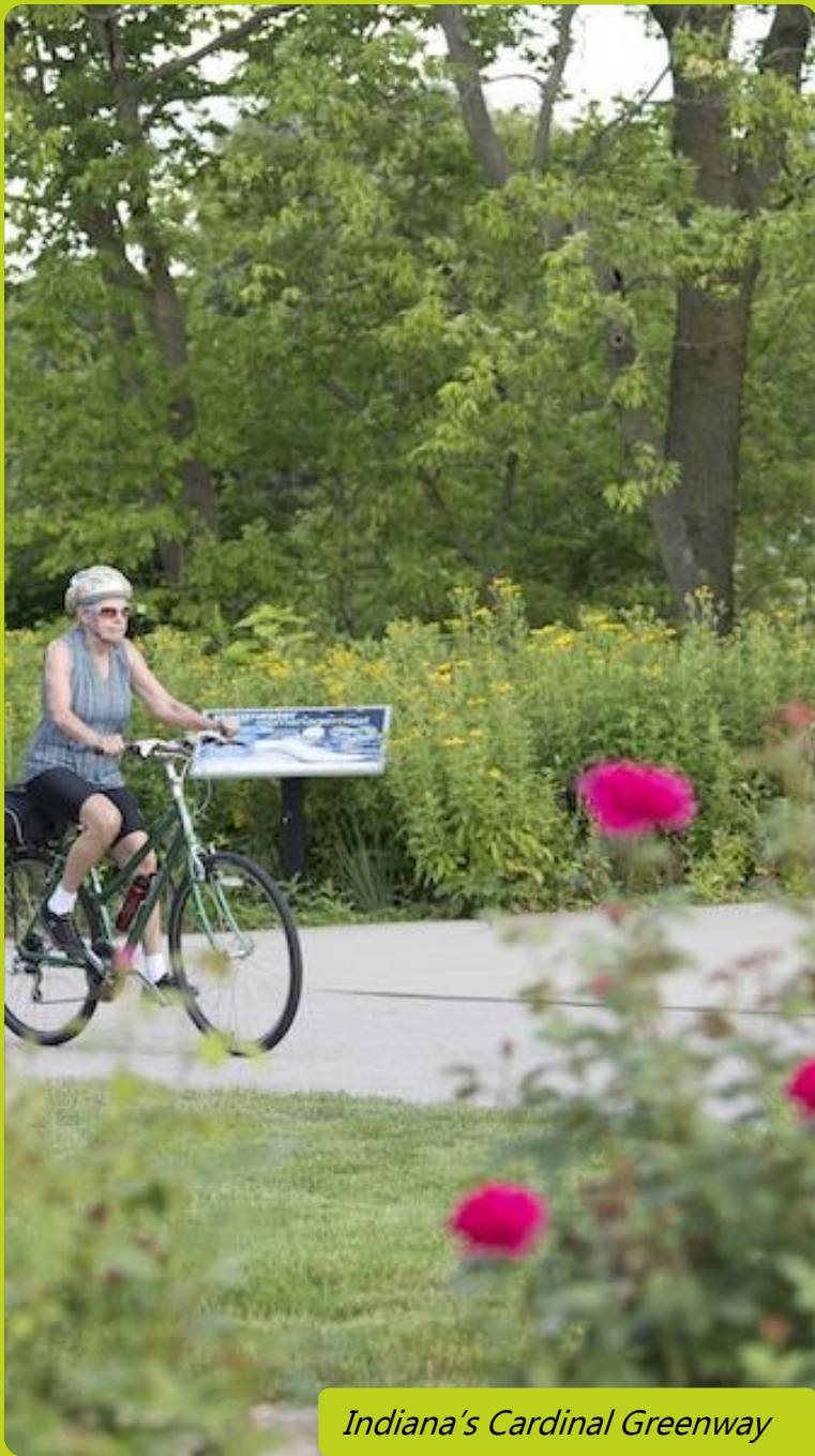
Indiana's Cardinal Greenway