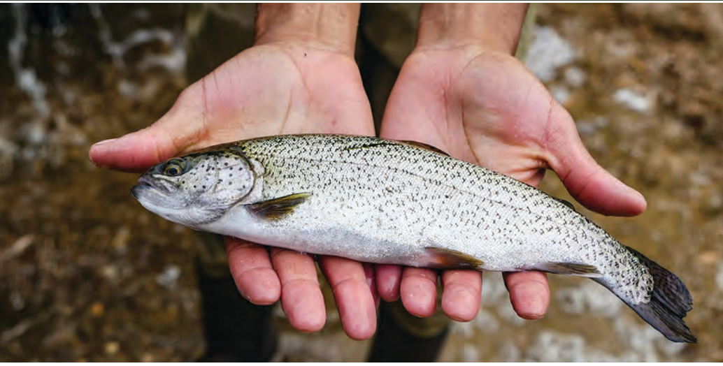
Stocked 323,350 spring trout (197,599 pounds) and 27,000 fall trout (20,000 pounds).

39 new shellfish aquaculture leases for the planting and harvesting of oysters in Maryland waters processed and issued by the Aquaculture and Industry Enhancement Division. As of December 31, 2019, there were a total of 457 shellfish aquaculture leases on 7,306 acres in our state and these leases produced nearly 60,000 bushels of oysters last year.