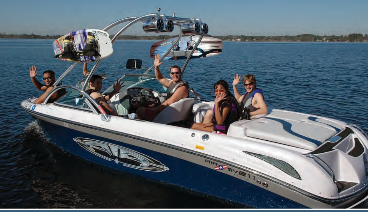
10,754 students took and passed the online Maryland Basic Boating class.

Reserve Officers performed a total of 591 of these inspections throughout the state in 2019.