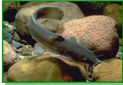
Stone Cat, Matthew J. White

In Maryland there are 607 wildlife species at risk. These include endangered and threatened species and others in need of conservation measures. Sensitive plants and animals depend on a variety of habitats on both public and private lands. Restoring and maintaining habitat on these lands is essential to the survival of wildlife. The Maryland Department of Natural Resources, in partnership with federal agencies and private land trusts, is allocating increasing financial and technical resources to the conservation of fish and wildlife on private lands.