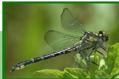
Sable Caddisfly, Giff Beaton

Projects can be designed to incorporate various types of management techniques to best suit the landowners needs and the wildlife present.