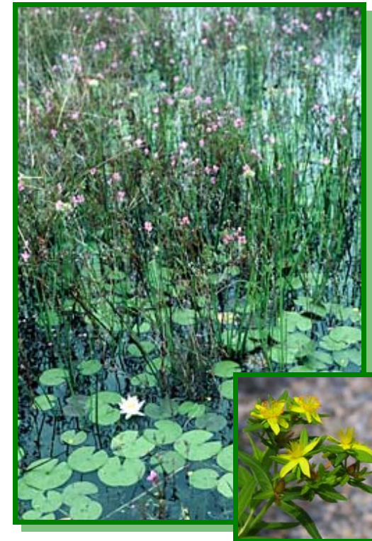
Delmarva Bay

Demonstrate the importance of habitat conservation