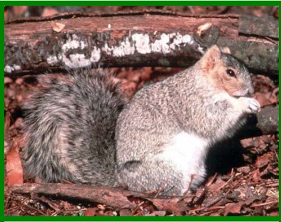
Delmarva Fox Squirrel

The Landowner Incentive Program provides private landowners with technical advice and cost-share assistance to help conserve species at risk in Maryland. The ultimate goal is to protect, enhance, and restore habitat for rare, threatened, and endangered species.