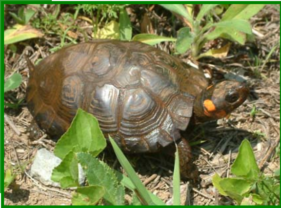
Bog Turtle