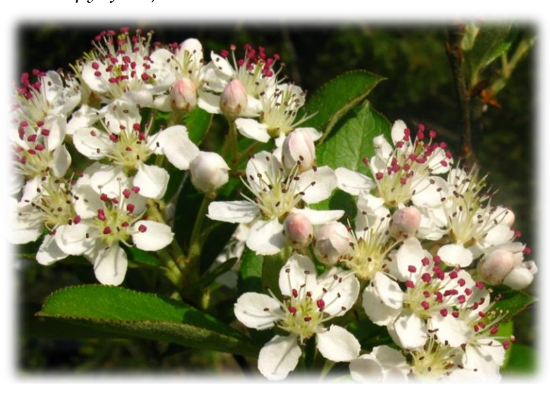
Red chokeberry in bloom

Red chokeberry is one of the striking plants in my winter garden. While most shrubs and small trees are bare this time of year, chokeberry is sporting its fabulously colorful berries. Red chokeberry is shrub in the Rose family (Rosaceae) that can grow up to 13 feet in height. This shrub can be found throughout the State in forested wetlands, upland forests, fields, and dunes. It can tolerate infrequent flooding and even salt from time to time. Red chokeberry prefers sunny to partially shaded conditions in slightly acidic soil.