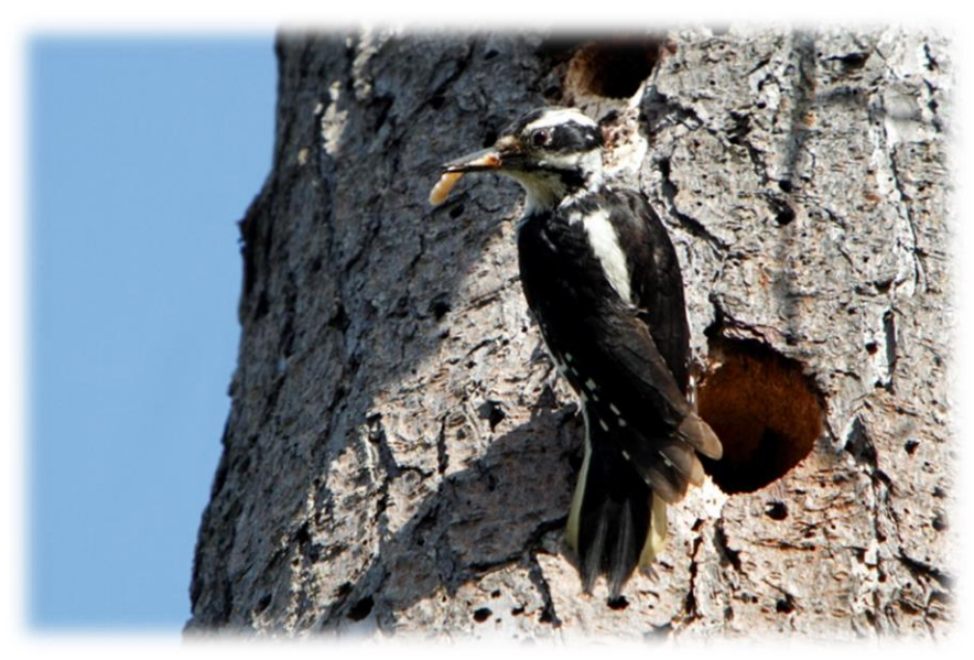
Hairy woodpecker with food for young

Downy woodpeckers are sparrow-sized woodpeckers that can be found year-round throughout much of the United States. Unlike hairy woodpeckers, downy woodpeckers rarely make it into Central America. These woodpeckers can be found in woodlots, fields, and backyards. Oftentimes, they can be seen perching on reeds or goldenrod, attempting to extract larvae in plant galls. Like their larger cousins, downy woodpeckers also consume beetle larvae and nest in tree cavities. The typical downy woodpecker brood consists of 3-8 eggs that take 12 days to incubate. When excited, downy woodpeckers will sound off with several very sharp 'pik' notes. Similar to other woodpeckers, both sexes will drum to attract mates and to mark territory.