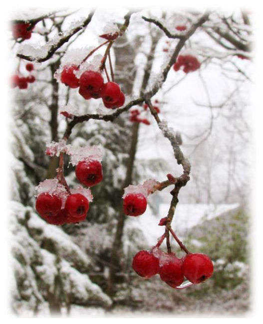
Red chokeberries take a couple freezes to get ripe! By Kerry Wixted

Red chokeberry grows relatively slow, but it is certainly worth the wait! The shrubs can also be pruned into hedges to fit certain landscapes. Black chokeberry ( Photinia melanocarpa ) is a slightly smaller relative that grows in similar habitats and sports purplish berries in the fall and winter.