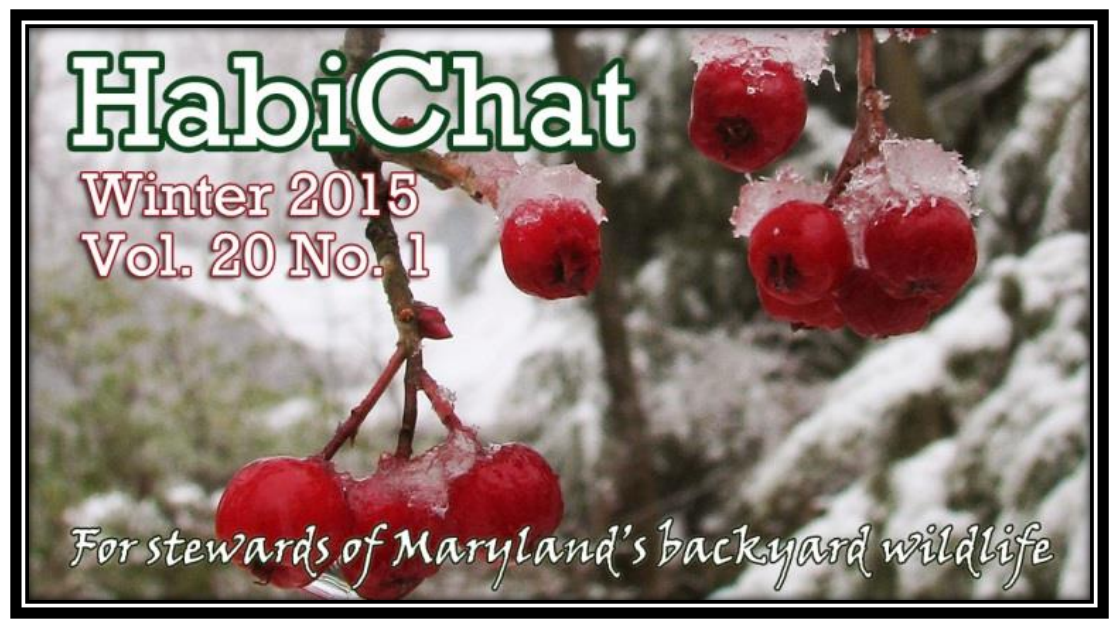
HABITAT - the arrangement of food, water, cover, and space - IS THE KEY.