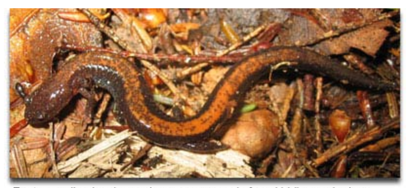
Eastern redback salamanders are commonly found hiding under logs.

When snags fall and become logs, the gifts keep on coming. Logs provide excellent cover for multiple species of salamanders as well as small mammals. If the log is in the right location, a male ruffed grouse may utilize it for courting the ladies. If the log is large enough and has holes in it, species like foxes, raccoons and opossums may use it for shelter. Insects also continue to feast upon the decaying wood, providing a buffet for insect predators. Sometimes logs in advanced stages of decay will serve as "nurse" logs, by providing nutrients and moisture for other plants to grow. As the wood continues to decay, mushrooms and lichens will cover its surfaces and eventually, some of the tree's excess nutrients will return to the soil, fertilizing the area and paving the way for the next generation of plants.