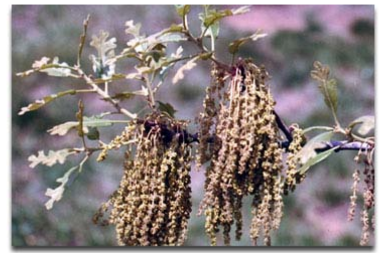
White oak catkins

White oaks are long-lived trees that can get up to 150 feet tall. They are named for their bark which appears whitish between thick ridges. White oaks have glossy, bright green leaves which have 5-7 rounded lobes. These leaves alternate around gravish stems. Like all oaks, white oaks have multiple buds clustered on the ends of their branches. These buds tend to be reddish brown and rounded.