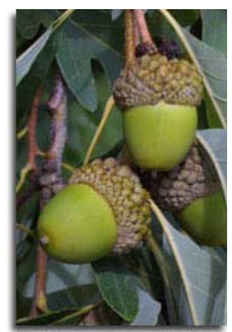
White oak acoms

and are in clusters that droop down, allowing wind to distribute the pollen. Female flowers are reddish green and are found in small, single spikes by the leaves.