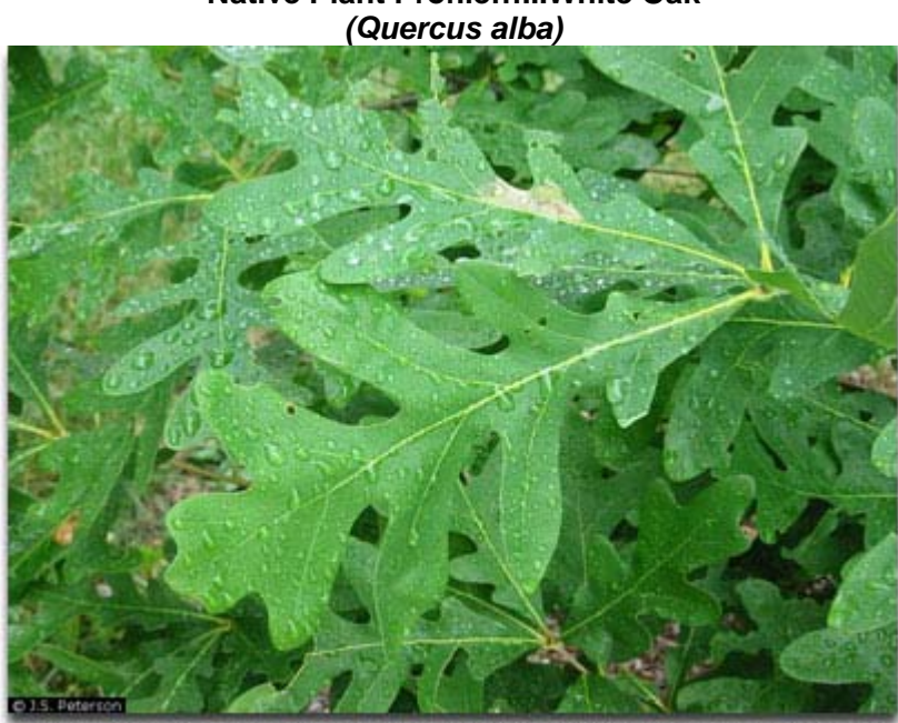
Native Plant Profile.....White Oak