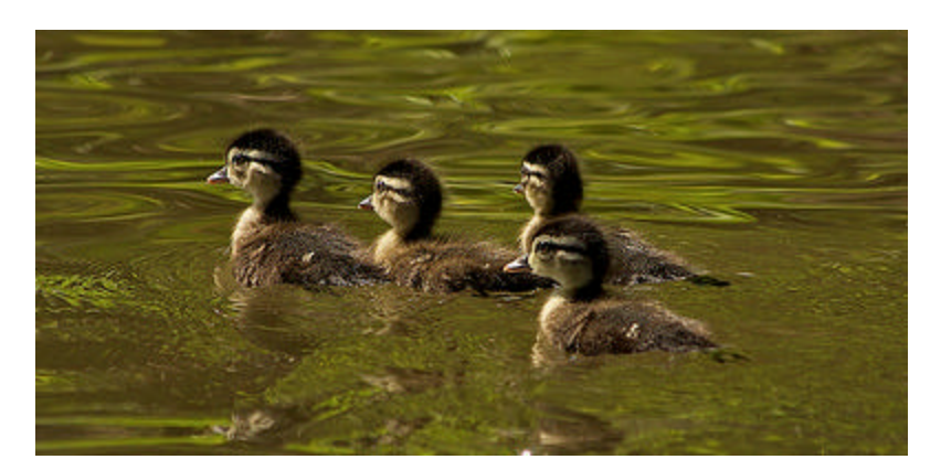
Ducklings by: Stephen Durrenberger

ground, females will lead the ducklings to the nearest body of water. They will not come back to the nest. Wood Duck young can fly about 60 days from hatching. Until that time, their mother looks after them and protects them from harm.