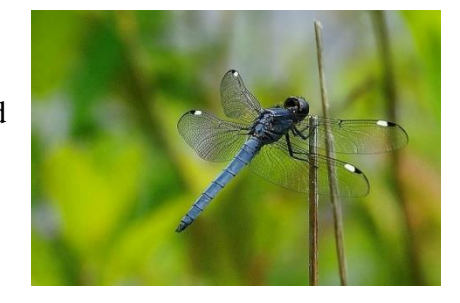
Spangled skimmer