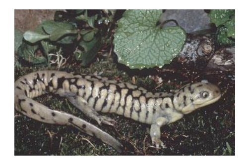
Eastern tiger salamander

The eastern tiger salamander, once present across both Coastal Plain Provinces in Maryland, is state-listed as Endangered, and breeding populations are found only in Caroline and Kent counties on the Eastern Shore. Through this SWG project, WHS developed a statewide management plan for the eastern tiger salamander, a large salamander that spends much of its life underground and requires vernal pools to breed. Priorities for eastern tiger salamander conservation include habitat protection and restoration, a better assessment of the geographical distribution of the population, and a better understanding of population trends and demographics. From 2008 to