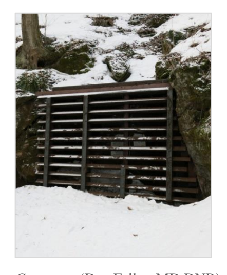
Cave gate

In order to protect hibernating and roosting bat populations, including SGCN bats, WHS initiated the installation of cave gates at the entrances to several caves and mines in Maryland. In 2006, WHS assessed the cave gates and all cave and mine gates of medium or high conservation value or of human safety concern