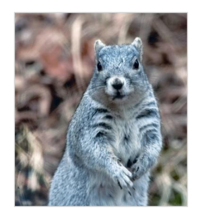
Delmarva fox squirrel, a species of concern in Maryland

One of the most difficult issues in writing the 2015 SWAP was working with the expansive amount of research presented in the last decade about the causes and effects of climate change. This SWG project supported regional networking opportunities for states and organizations to share information about climate change in the region and how individual states were integrating climate change topics into their own SWAPs. Using NatureServe's Climate Change Vulnerability Index tool, WHS staff completed vulnerability assessments for 476 SGCN. In addition, the vulnerability to climate change of 47 non-coastal habitats (ecological community groups) was assessed using a habitat vulnerability model available from Manomet.