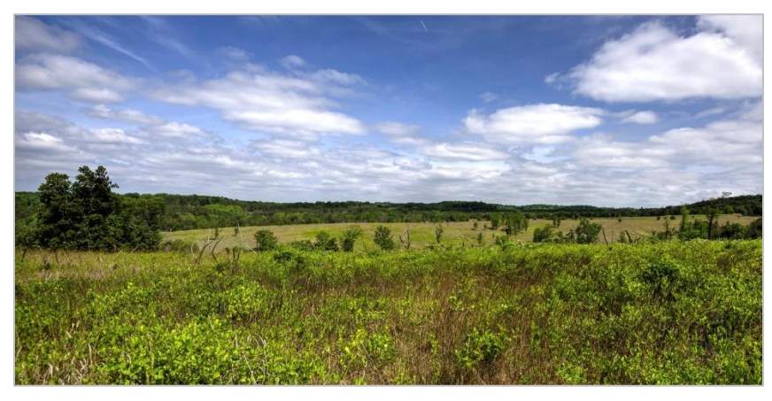
Soldiers Delight (Richard Orr)

The eastern sedge barrens leafhopper, state listed as Endangered, lives in a very specific habitat on one plant species in open, upland areas. The serpentine barrens found at Soldiers Delight provided this ideal habitat until the area became overrun with Virginia pine ( Pinus virginiana ) and invasive plants like mile-a-minute vine ( Persicaria perfoliata ),