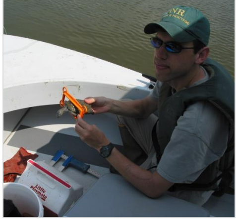
Biologists checking crab pot for bycatch reduction devices (BRDs) (left); demonstrating BRD function (right)

project to determine whether head-started individuals actually survive to adulthood more frequently than wild individuals, whether head-starting causes any changes to terrapin life history, and, finally, whether the head-start program is a viable conservation strategy. This research is being carried out through a contract with Ohio University to conduct mark-recapture surveys at the Poplar Island archipelago area in the Chesapeake Bay. Researchers mark both wild and head-started diamond-backed terrapins at a young age and released the terrapins. In