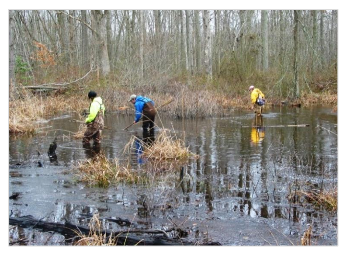
MD DNR biologists looking for eastern tiger salamander egg masses

This project, undertaken from 2007-2009, revitalized the eastern tiger salamander populations at multiple wetland habitats. After eradicating thick growths of invasive plants at the sites, salamander egg mass numbers increased tenfold. WHS assessed the Massey Pond site in Kent County for construction of a water control structure to manage fish entry into the pond, but, after completion of invasive plant removal, WHS found that such a structure was not necessary. Invasive plant monitoring continues at these wetland sites.