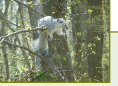
Delmarva fox squirrel