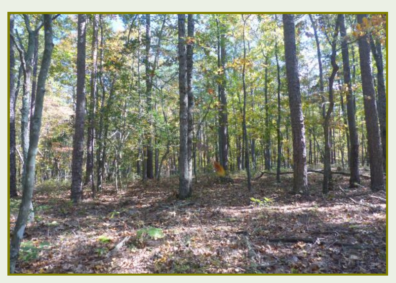
Coastal Plain Oak-Pine Forest