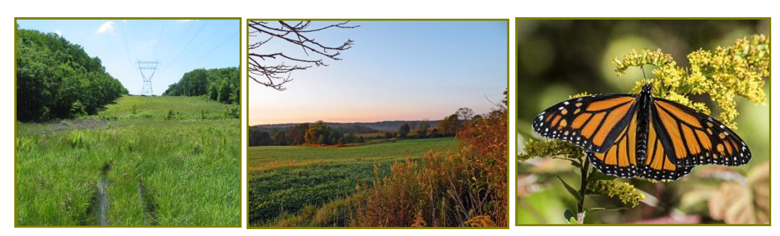
Left to right: Human-created habitat such as utility rights-of-way and managed grasslands may also provide habitat for Species of Greatest Conservation Need, including grassland birds, bats, and invertebrates such as the monarch butterfly