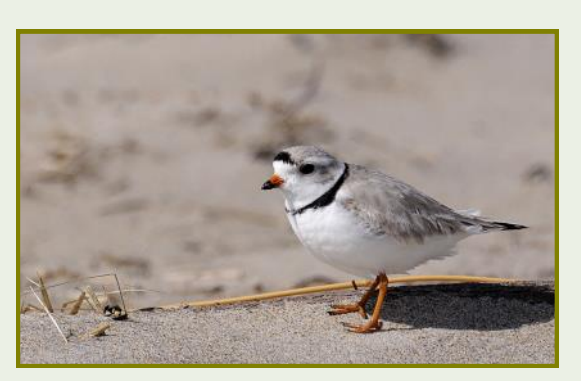
Piping plover

More than 15,000 animal and plant species call Maryland home. Nearly 1,200 of these species are rare, uncommon, or declining. Maryland's wildlife distribution and abundance ultimately depend on the ecological diversity of the state's habitats. The varied physiographic features, geology and resulting soil types, topography, and climate of Maryland support a range of plant communities and aquatic environments that provide various habitats for wildlife. Maryland's landscape, wetlands, and waterscape, including the Chesapeake Bay and Atlantic Ocean, support some of the country's most imperiled and endangered species, such as the dwarf wedgemussel, piping plover, and bog turtle. A few animals in Maryland are found nowhere else in the world.