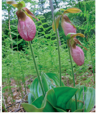
Pink lady's-slippers are named for the color of their distinctive moccasin-shaped flowers.

for dragonflies and amphibians alike. Visitors can enjoy the landscape by hiking old logging roads that course through the forest.