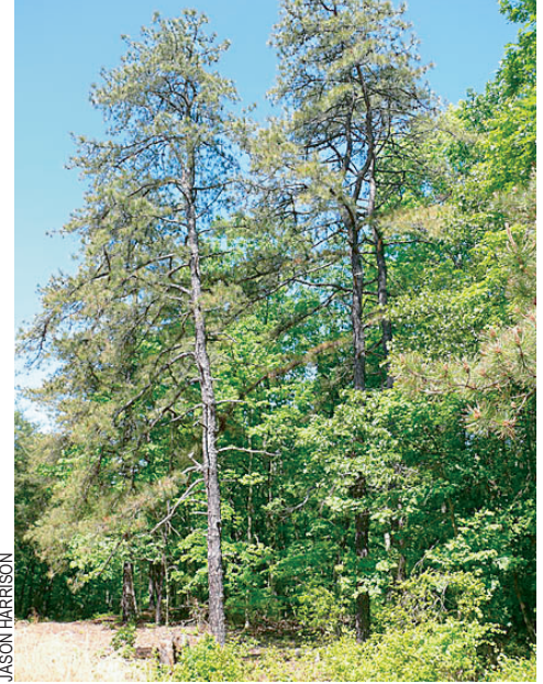
Pitch pines can still be found among the mixed deciduous trees and shrubs at Plum Creek.

Special Note: Plum Creek Natural Area is used seasonally by hunters.