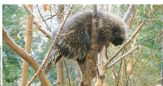
The solitary North American porcupine spends much of its time foraging in the trees.