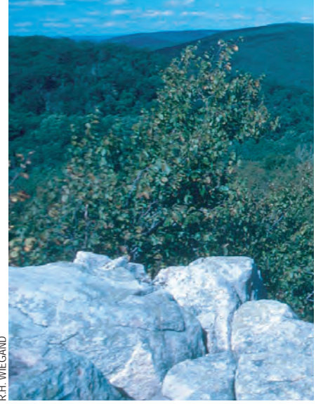
The impressive view of the Blue Ridge Mountains as seen from the quartzite cliff of Cat Rock.

Cunningham Falls State Park 14039 Catoctin Hollow Road Thurmont, MD 21788 P: 301-271-7574