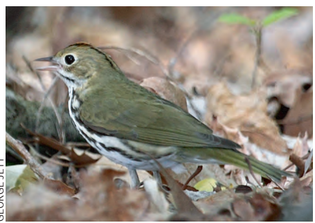
The ovenbird is a ground-dwelling warbler that thrives in large forest tracts. In spring, the birds build dome-covered nests that resemble Dutch ovens.

include American black bear, bobcat and the bristly North American porcupine, as well as many birds, such as ovenbird and broad-winged hawk. The combination of a large forest tract with an extensive boulder field also provides core habitat for the Allegheny Woodrat ( Neotoma magister ), listed as Endangered in Maryland.