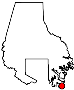
Location of North Point State Park within Baltimore County