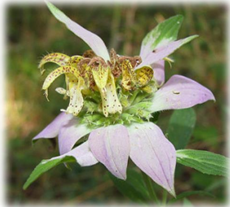
Beebalm (left) and spotted beebalm (right) also are great wildlife plants by Kerry Wixted

Want more Habi-chats? Check out our archives here: http://dnr2.maryland.gov/wildlife/Pages/habitat/habichat_archives.aspx