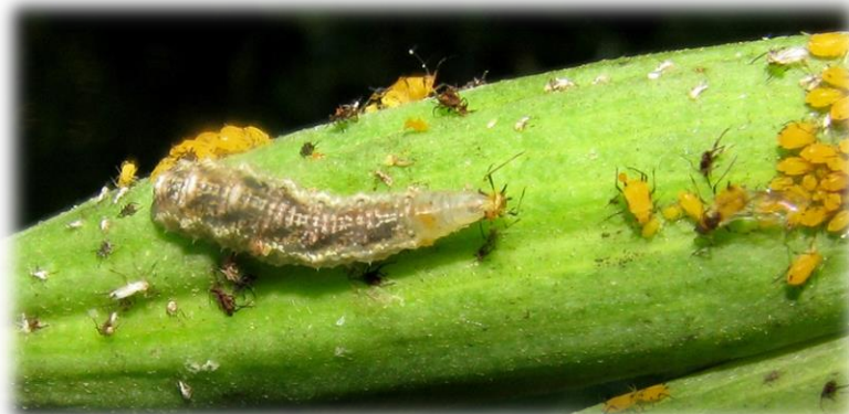
Syrphid fly larvae eating aphids

Common beneficial predators and parasitoids in the garden include: beetles (soldier beetles, ladybugs, etc), green lacewings, spiders, syrphid flies, and wasps . Below is a list of plants that have been found to attract beneficial predators and parasitoids!