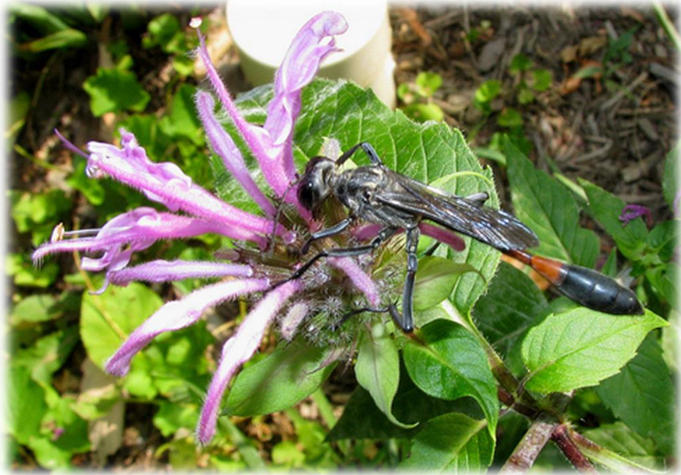
Thread-waisted wasps are beneficial insects that nectar on wild bergamot by Kerry Wixted

Wild bergamot's relatives include spotted beebalm ( Monarda punctata ) and beebalm ( Monarda didyma ). The latter contains brilliant red flowers that are highly attractive to hummingbirds. Beebalm grows best in moist soils in full sun while spotted beebalm prefers drier soils. All three species have high pollinator value and attract predatory insect as well!