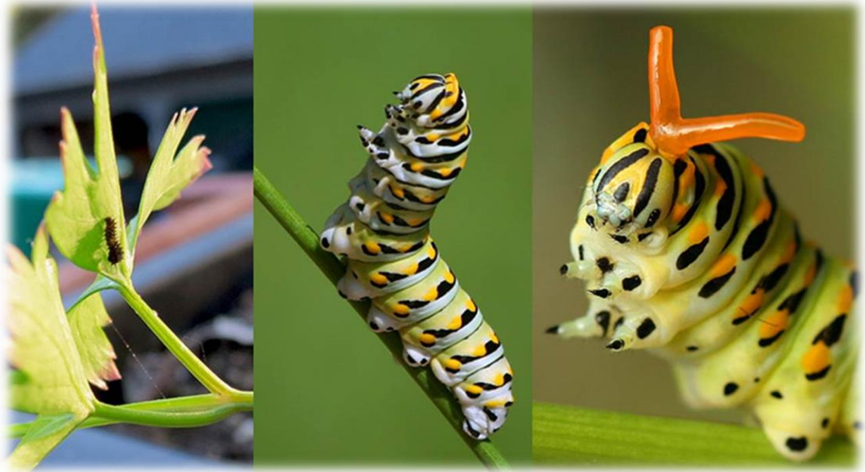
Early instar (left) by Kerry Wixted; Later instar (middle) by Ken Slade, Flickr CC by NC 2.0; Later instar (left) by Lynette MT, Flickr CC by NC 2.0

To attract black swallowtails, it is important to provide both host (caterpillar ) and nectar (adult) plants. Black swallowtails host on plants in the carrot family (Apiaceae) including dill, fennel, parsley, Queen Anne’s lace, rue, and others. Adults prefer to nectar on plant such as milkweed, thistle, and joe pye-weed.