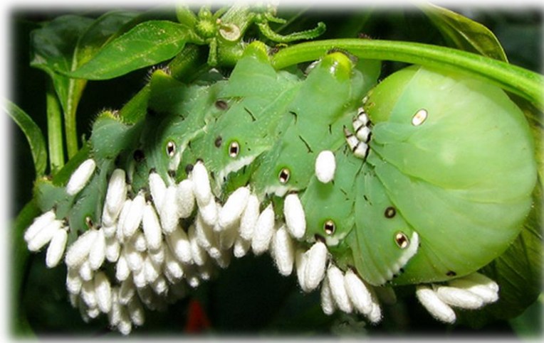
Hornworm with braconid wasp pupae by Kerry Wixted

Did you know? Many wasps and other natural enemies of insects rely on plant nectar or pollen as adults and invertebrates as juveniles. Therefore, planting flowers that attract adult predators and parasitoids can increase natural pest control in your backyard. Predators are animals that attack and consume other animals whereas parasitoids live in or on their host and kill the host in the process. Most parasitoids are specialists and only attack certain species. For example, a common parasitoid is the braconid wasp ( Cotesia congregatus ) which lays its eggs inside of tobacco and tomato hornworms.