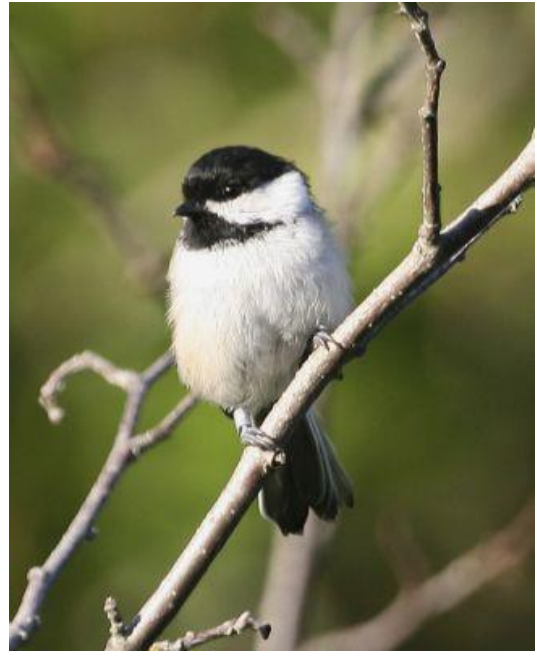
Chickadees and other birds use brush piles for shelter