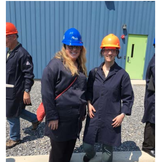
AES 10 MW battery in Cumberland, MD