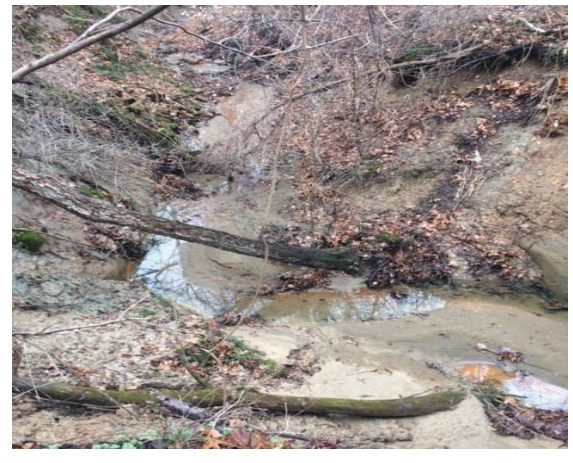
Prior to restoration work, Flat Creek was little more than a trickle due to heavy erosion and sediment filling in the creek bed (2018).

It has been about three years since the restoration project was complete and already the stormwater flows have slowed, and native vegetation and wildlife is flourishing. (story continues on page 3)