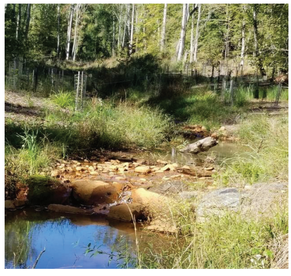
Step pools and planted vegetation in Flat Creek (2021).