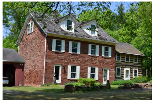
Quarry Master's House before and after.