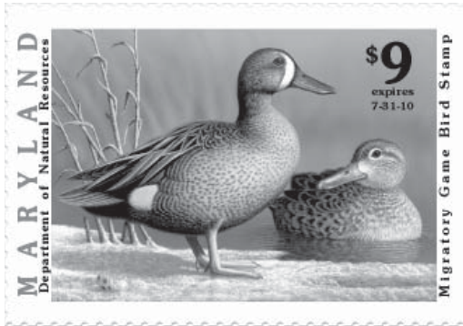
Icy Refuge - artwork by Wally Makuchal Jr.