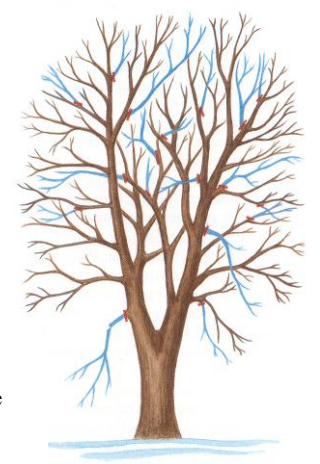
How To Prune Trees USDA Forest Service NA-FR-01-95

Crown thinning is the selective removal of live branches to reduce crown density. Thinning should result in an even distribution of branches on individual branches and throughout the crown. The percentage of foliage, the location and size of parts to be removed shall be specified.