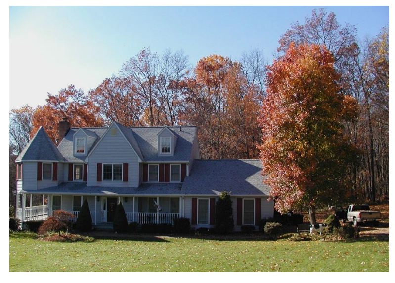
Owners of small-acreage lots with woodlands can benefit from professional assistance in managing their property.

Foresters with at least a Bachelor of Science degree and two years of practical experience under the quidance of a licensed forester. Foresters on this list are Licensed Professional Foresters with the State of Maryland's Board of Foresters within the Department of Labor, Licensing and Regulation