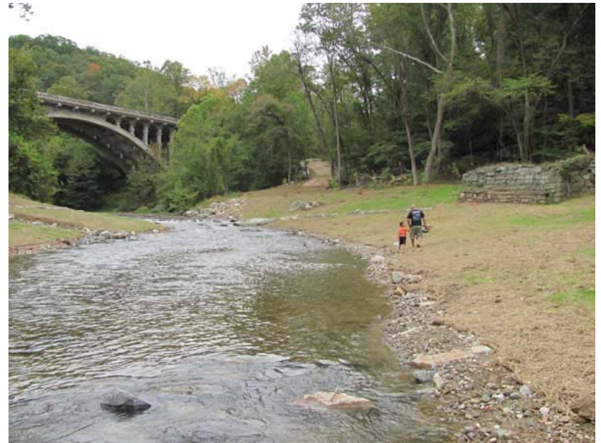
Union Dam – Post Removal