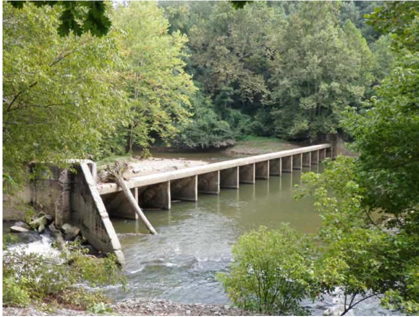
Union Dam – Pre Removal