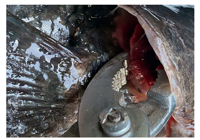
Remove gill arches from both sides of the head using pliers. Subdue large fish with a blunt blow first, if necessary.

4. Use an awl, or make your own, to puncture the skull.