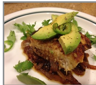
Greens on blues, a Latin-inspired Dish with Chesapeake Bay Blue Catfish