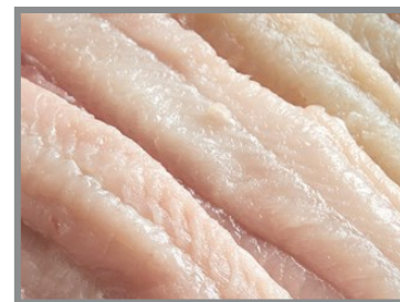
Chesapeake Bay Blue Catfish Fillets