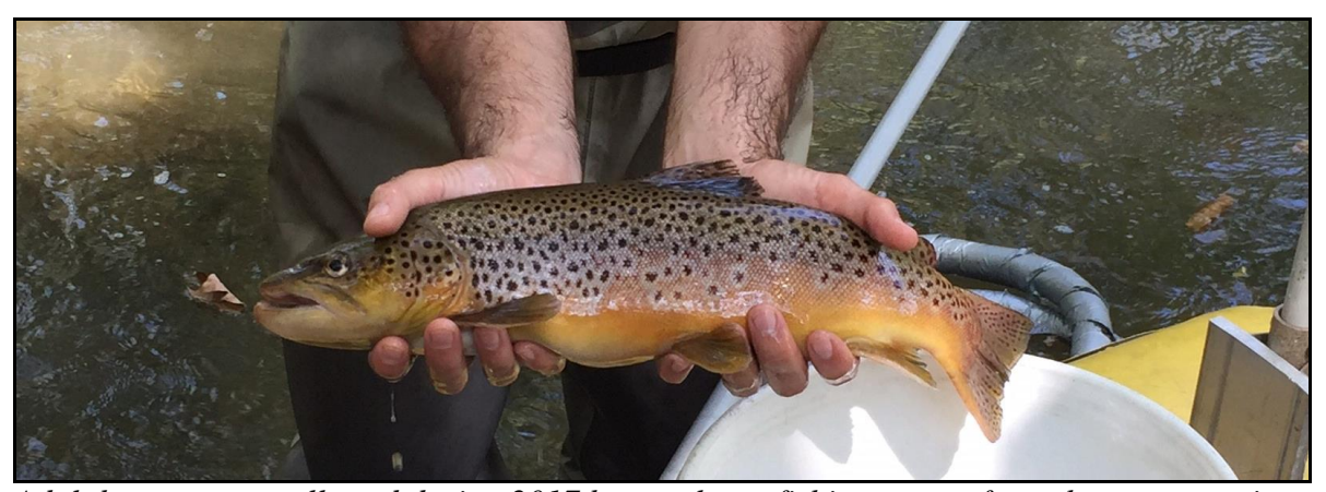
Adult brown trout collected during 2017 barge electrofishing survey from the upper sections Antietam Creek

Antietam Creek is a unique freshwater resource. Typical of heavily influenced limestone spring creeks, it supports a productive aquatic ecosystem that is capable of growing and supporting trophy size fish. The creek is primarily managed for brown and rainbow trout but also supports a healthy population of smallmouth bass, channel catfish, common carp and the occasional walleye and muskellunge in the lower section below Devil's Backbone County Park. The Maryland Department of Natural Resources, Freshwater Fisheries Program monitors the status of these sportfish populations using barge mounted electrofishing equipment. Single pass surveys are conducted at various sites throughout the creek during the fall when flows are low and water temperatures are less stressful on the fish. Measures of relative abundance (catch per effort) and gamefish size distribution are used to compare trends in the fishery over time.