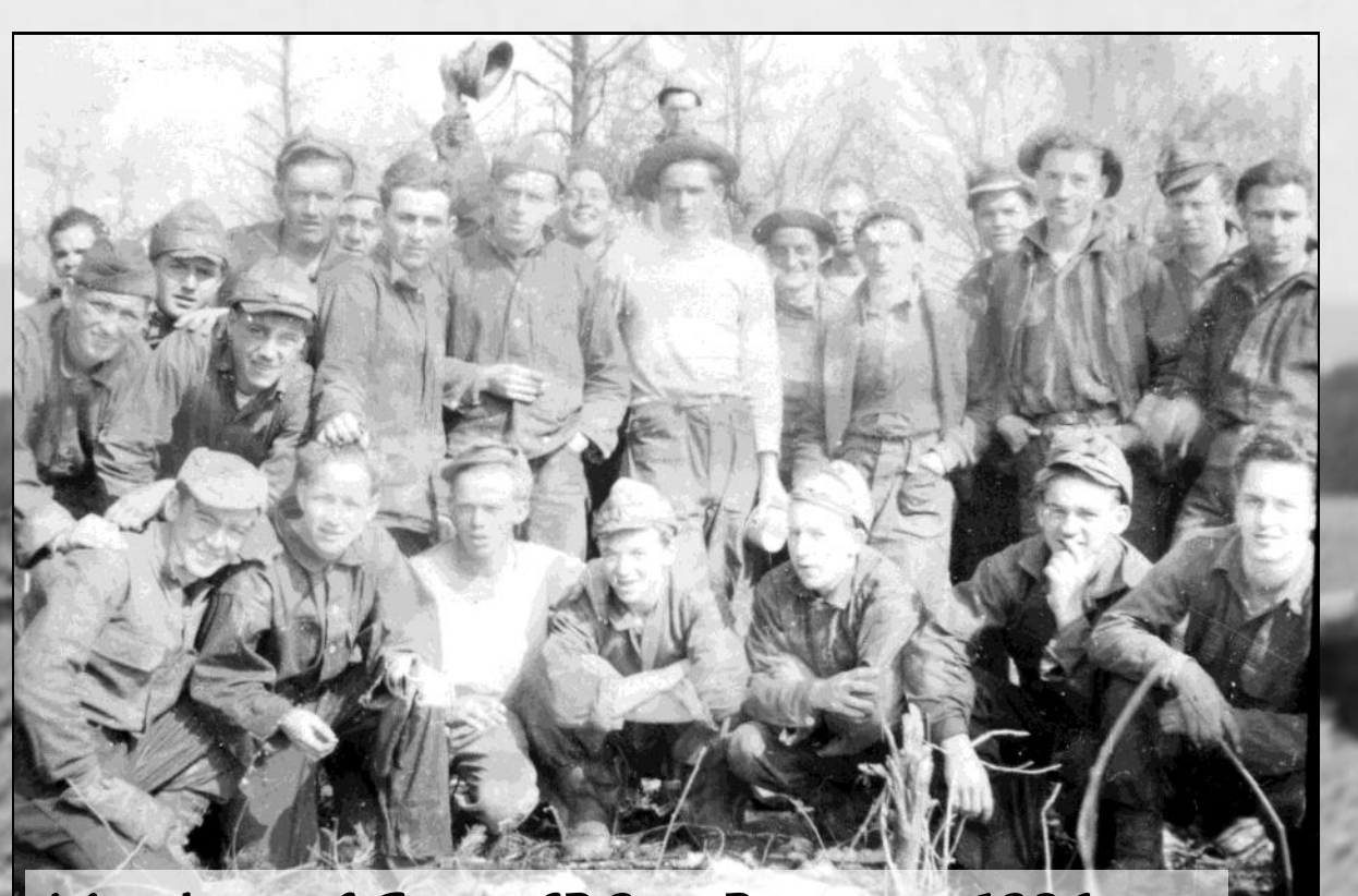
Herrington Manor, New Germany, Fort Frederick, Washington Monument, Gambrill, Patapsco Valley, Elk Neck, and Pocomoke

Many state parks today still use CCC facilities, including River.