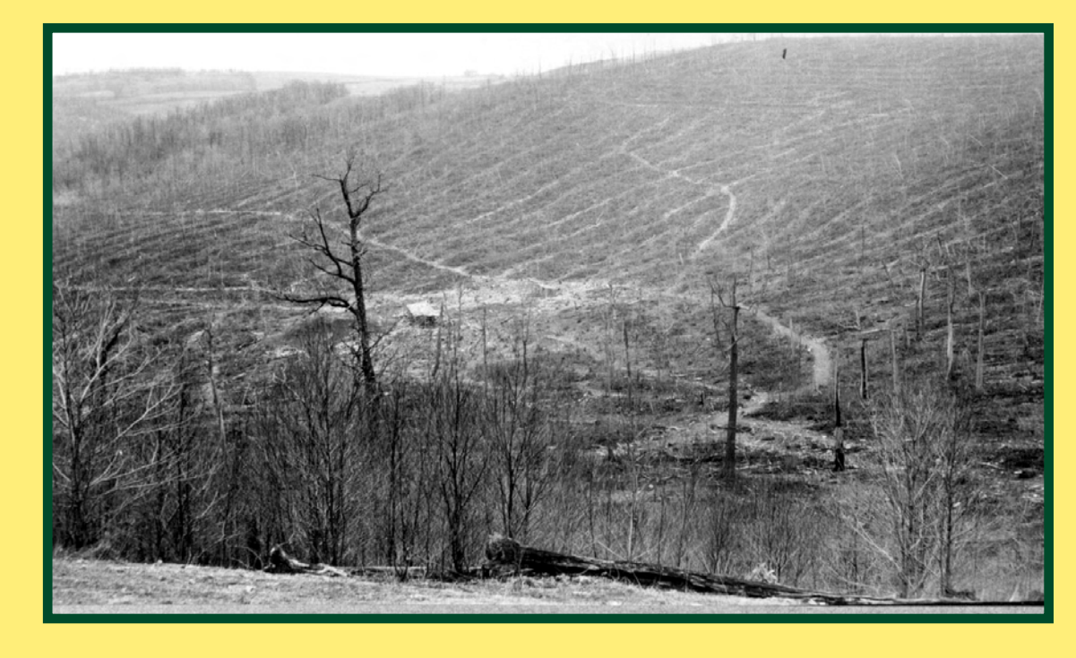
A denuded forest landscape near Cumberland, MD

In addition, Besley and his staff conducted an exhaustive statewide inventory of forest resources; devised methods to detect and fight forest fires; inaugurated a program of reforestation, including the establishment of a state tree nursery in 1914; and pioneered the popular Champion Big Tree Program, now a celebrated nationwide contest.