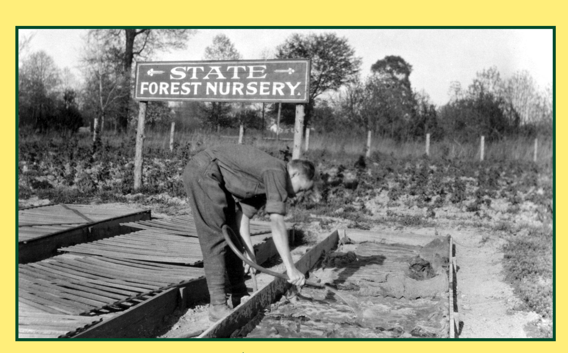
Watering seed beds at the State Nursery, May 1926

In addition, Besley and his staff conducted an exhaustive statewide inventory of forest resources; devised methods to detect and fight forest fires; inaugurated a program of reforestation, including the establishment of a state tree nursery in 1914; and pioneered the popular Champion Big Tree Program, now a celebrated nationwide contest.