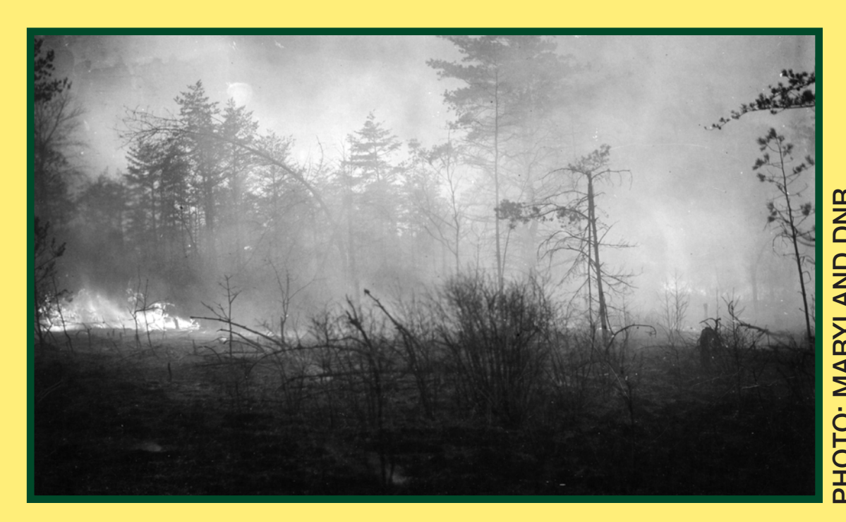
A forest fire near Beltsville, MD burned over 1000 acres on April 17, 1926.

For the next 36 years, Besley worked tirelessly to stem the tide of forest destruction by educating the general public, especially private woodlot owners, on the merits of forestry and forest conservation.