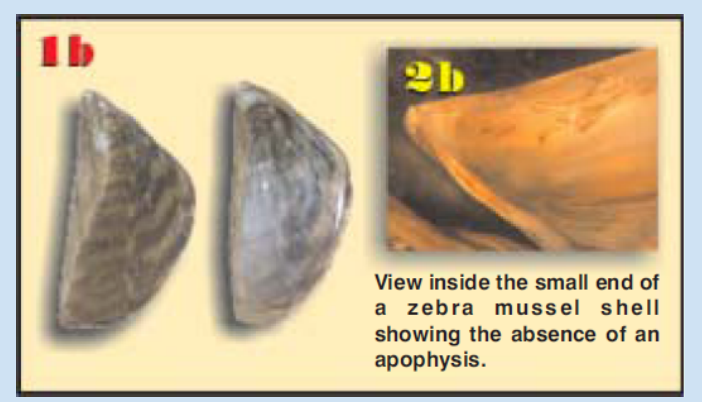
External and internal view of zebra mussel shell.

We appreciate receiving information from keen observers and follow-up on each and everyone as quickly as possible. If you think you have found a zebra mussel, put them in a zip lock bag and freeze them or in a small glass jar with rubbing alcohol. Then call the Maryland Department of Natural Resources at 1-877-620-8DNR or 1-410-260-8604. TTY via Maryland Relay.