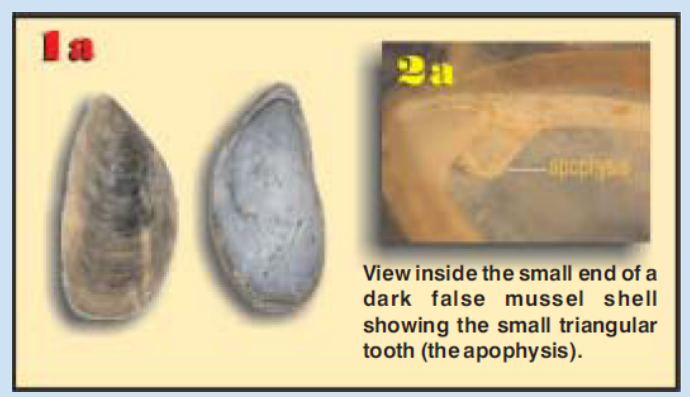
External and internal view of dark false mussel shell.

There are a few key characteristics to tell the two apart. Zebra mussels are more pointed at their narrowest end (1b), while dark false mussels are more rounded (1a). Zebra mussels are also taller and triangular in shape. The most reliable feature is inside the shell. After separating the two halves of the shell and removing the tissue, look closely at the inside of the shell at the narrow end. If you see a small triangle tooth (an apophysis) that extends down you are holding a dark false mussel (2a). Zebra mussels do not have an apophysis inside their shell (2b).