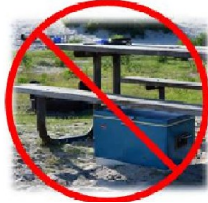
Avoid storing containers under picnic tables— horses know how to pull them out.