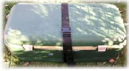
Secure your cooler with a nylon strap.