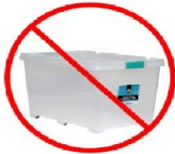
Avoid containers with snap on lids.