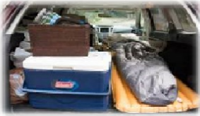
Store unattended food in your vehicle.