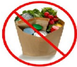
Avoid bags that do not close.