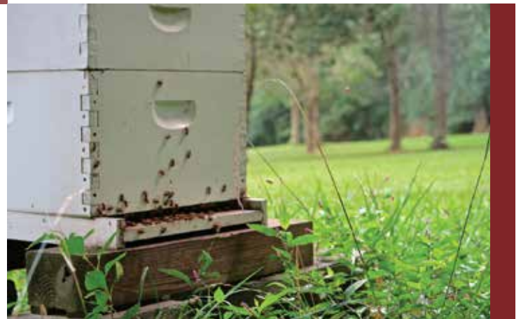
Bees buzz around the opening of their hive at Quiet Waters Park, one of several hives maintained by the Master Gardeners in Maryland.

To find out more about what the Master Gardeners bee keepers do and when and where you can attend one of their free demonstrations, visit their website at https://extension.umd.edu/anne-arundel-county/master-gardeners/beekeeping .