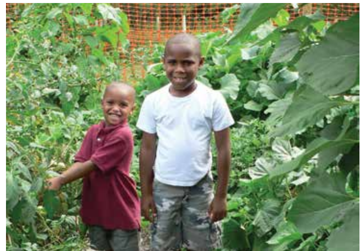
The Glass grandsons growing in the garden.

His son, Jordan, helped mark boundaries and plant trees. Grandchildren measured each other by vegetables in the garden. Time slows, the world quiets, senses sharpen, and blood pressure drops. Native, endangered, exotic, naturalized, and even invasive, many species find a place here. Pulling his pipe from a wry smile, Larry tells a tale of catch, release, and coexistence — at a distance. "We came across a five foot long timber rattlesnake near the house. Though legally protected, such a snake might not usually slither away from such a meeting. But this one