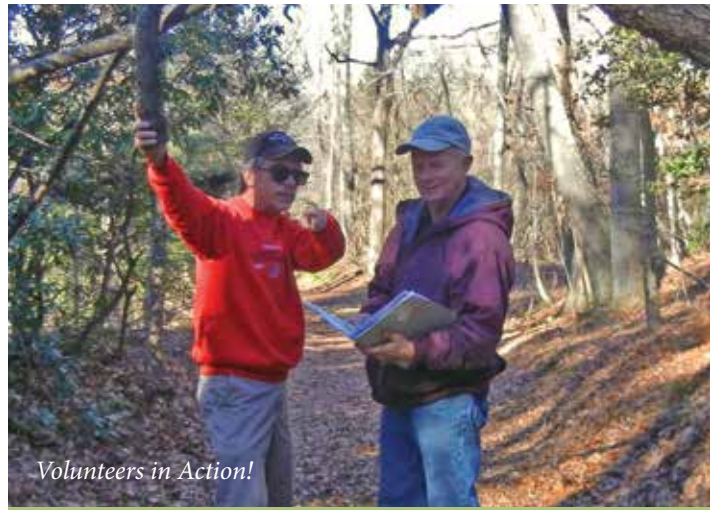
Volunteers in Action!