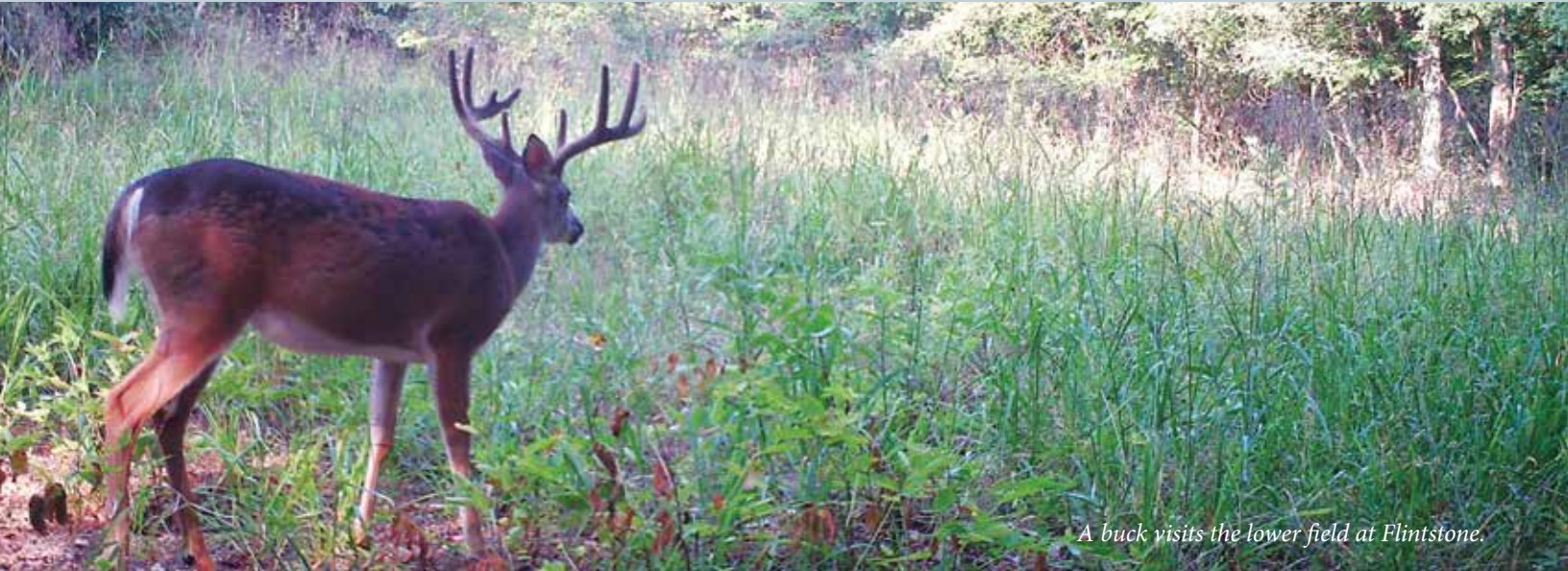
A buck visits the lower field at Flintstone.