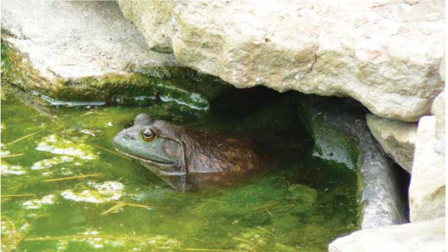
A bullfrog in the garden pond.