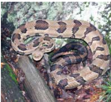
The wary local ... before exile.