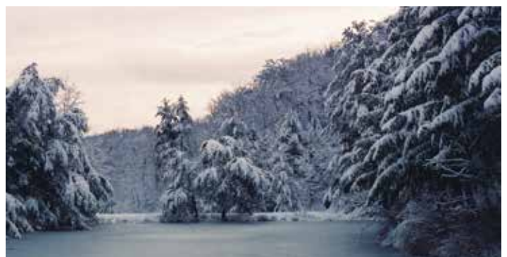
Winter at the pond.