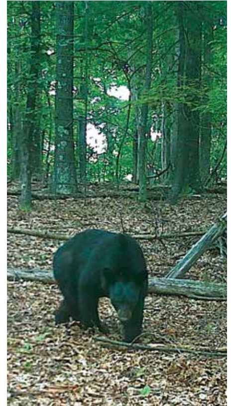
Nosing around the neighborhood.

for Flintstone reflects an evolving philosophy that values unobtrusive support and sustenance of land ... I can't honestly say whether I would be as dedicated if the utility bills or my dinner depended on its output." Knowing that living with, caring for, and earning from the land always means compromise, he continues, "It would be well for those of us whose sacrifices are marginal to respect and support those whose sacrifices cut deeper."