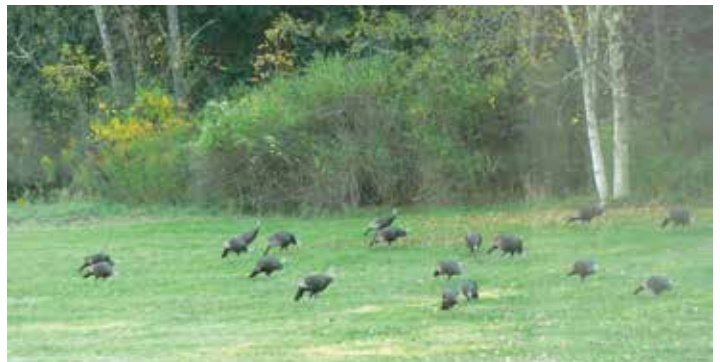
The turkey turn-out at the forest edge.