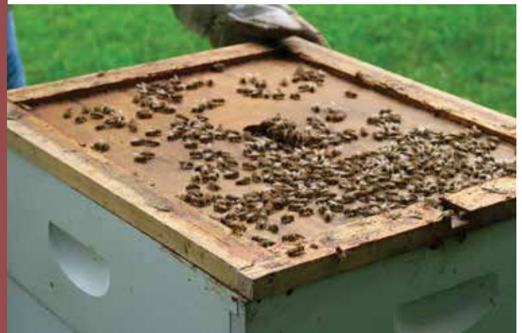
Master Gardener Bill takes a section of the hive box off to reveal the active bees inside before calming them down with smoke to allow him to examine the hive.

supporting local beekeepers' colonies by buying organic honey at your local farmers markets, or supporting organizations such as the Master Gardeners BeeKeeping project in your community.