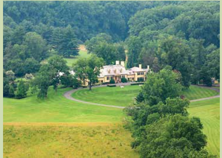
Belmont Manor.

The easement helps protect the scenic and historic rural character of the park, particularly the scenic views from Bel-