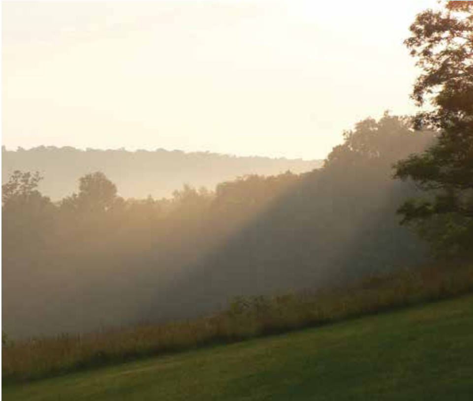
The field and hollow.